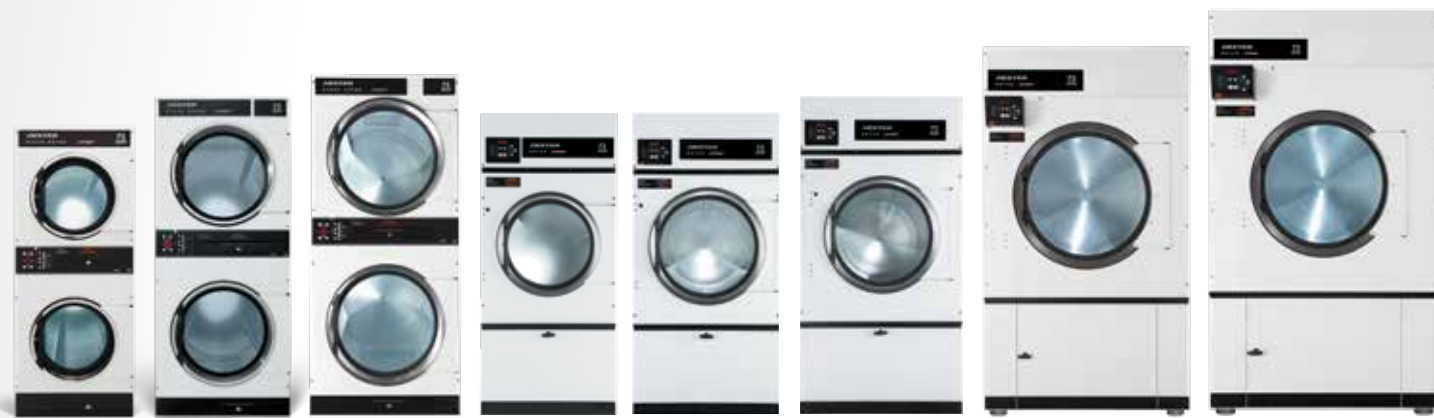
T-20x2 2 x 20 lb (2 x 9.1 kg) T-30x2 2 x 30 lb (2 x 13.6 kg) T-50x2 2 x 50 lb (2 x 22.7 kg) Reversing Option T-30 30 lb (13.6 kg) T-50 50 lb (22.7 kg) Reversing Option T-80 80 lb (36.3 kg) Reversing Option T-120 120 lb (54.4 kg) Reversing T-170 170 lb (77.1 kg) Reversing