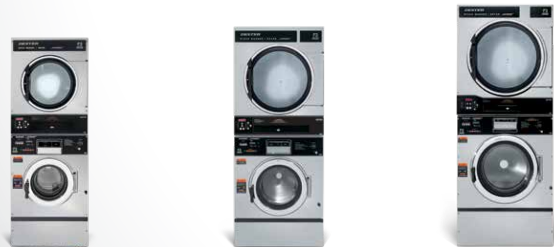
T-350 STACK WASHER-DRYER WASHER: 20 lb (9.1 kg) DRYER: 20 lb (9.1 kg) T-450 STACK WASHER-DRYER WASHER: 30 lb (13.6 kg) DRYER: 30 lb (13.6 kg) T-750 STACK WASHER-DRYER WASHER: 50 lb (22.7 kg) DRYER: 50 lb (22.7 kg) Reversing