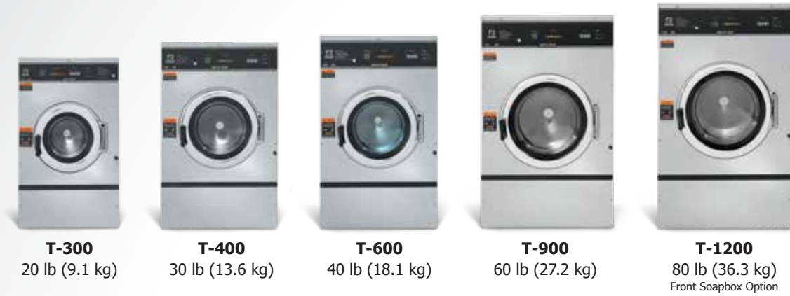
T-300 20 lb (9.1 kg) T-400 30 lb (13.6 kg) T-600 40 lb (18.1 kg) T-900 60 lb (27.2 kg) T-1200 80 lb (36.3 kg) Front Soapbox Option