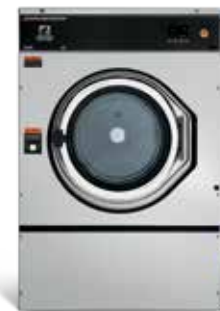
S-975 60 lb (27.2 kg)