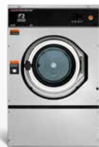
S-675 40 lb (18.1 kg)