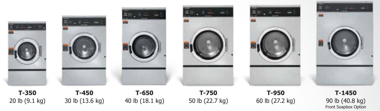
T-350 20 lb (9.1 kg) T-450 30 lb (13.6 kg) T-650 40 lb (18.1 kg) T-750 50 lb (22.7 kg) T-950 60 lb (27.2 kg) T-1450 90 lb (40.8 kg) Front Soapbox Option