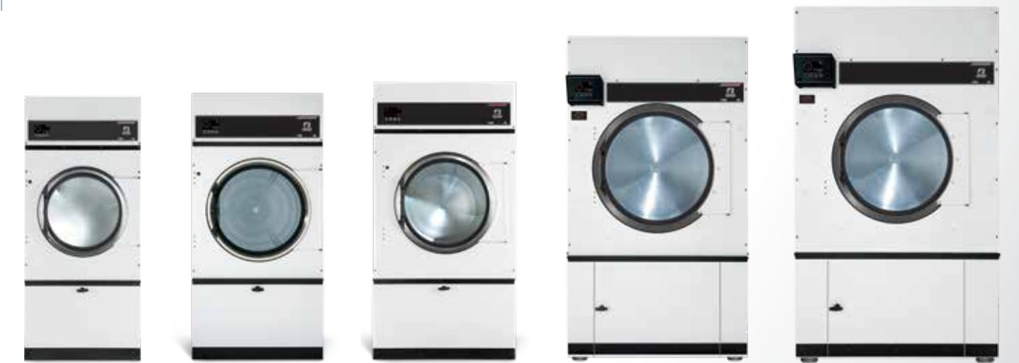
T-30 30 lb (13.6 kg) T-50 50 lb (22.7 kg) Reversing Option T-80 80 lb (36.3 kg) Reversing Option T-120 120 lb (54.4 kg) Reversing T-170 170 lb (77.1 kg) Reversing