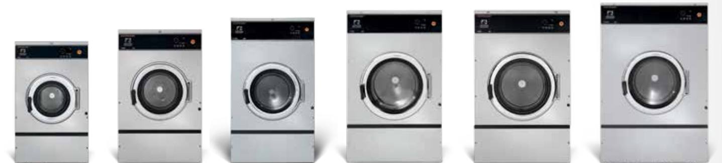
T-350 20 lb (9.1 kg) T-450 30 lb (13.6 kg) T-650 40 lb (18.1 kg) Electric & Steam Heat Options Express Plus Option T-750 50 lb (22.7 kg) T-950 60 lb (27.2 kg) Electric & Steam Heat Options Express Plus Option T-1450 90 lb (40.8 kg) Electric & Steam Heat Options Express Plus Option Front Soapbox Option